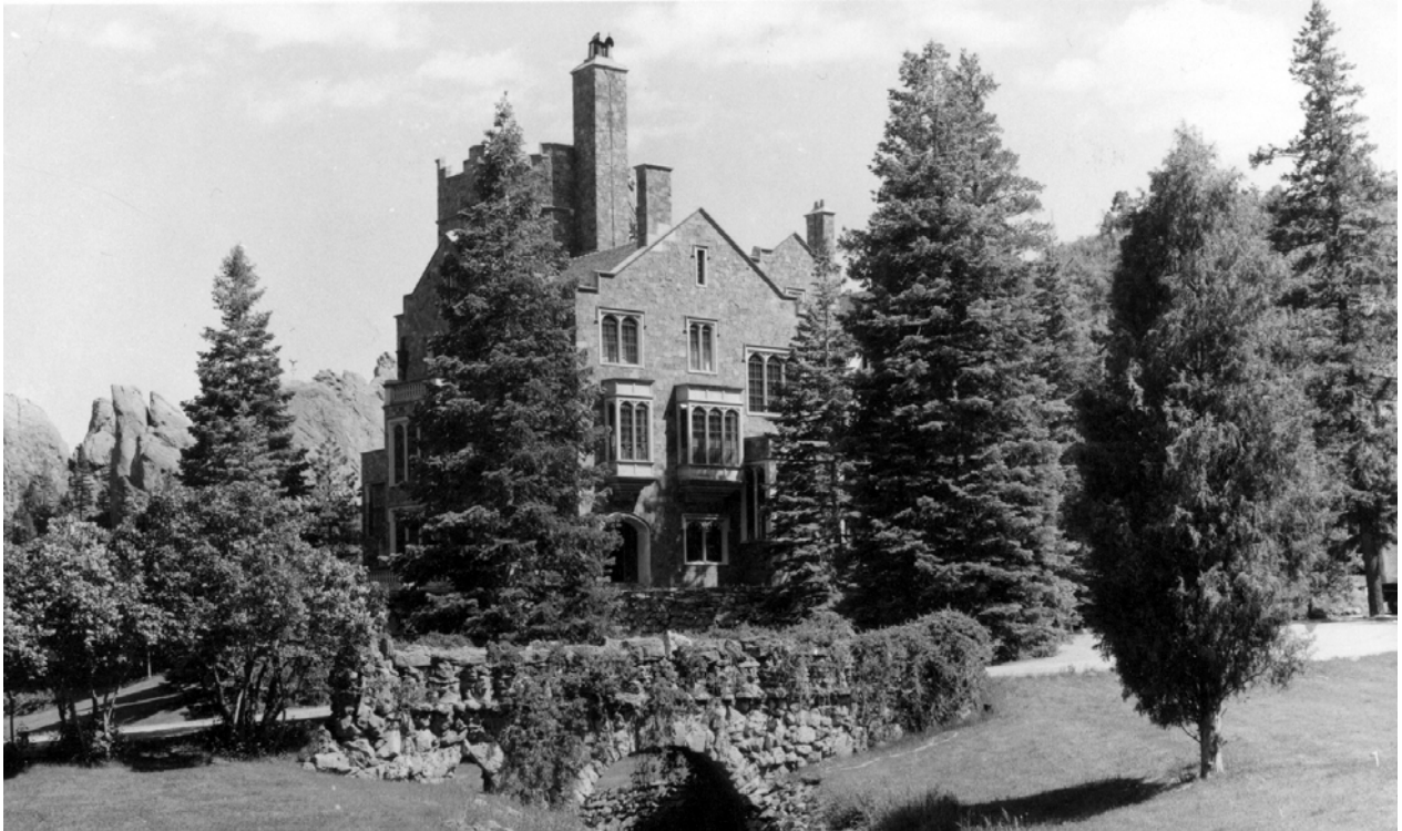
GLEN EYRIE, Valley of the Eagle's Nest , in Colorado, The Navigators main headquarters.